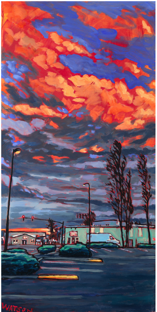
Right: The Glory of the Safeway Parking Lot 2025. 40x20" Acrylic on Canvas Example of my PNW Local Landscapes

Commissioned by the Finnriver Cidery and Farms. Chimacum, WA $8000 Working with a high school senior we gathered info from a vast number of industry leaders who's fields are dependant upon a healthy watershed. Using data from Fishing captains, WA Fish and Wildlife directors, City Water officials and many more, we created the concept of the mural to show the many facets of our watershed and its vital importance. The high school student helped develop the concept and paint the final mural.