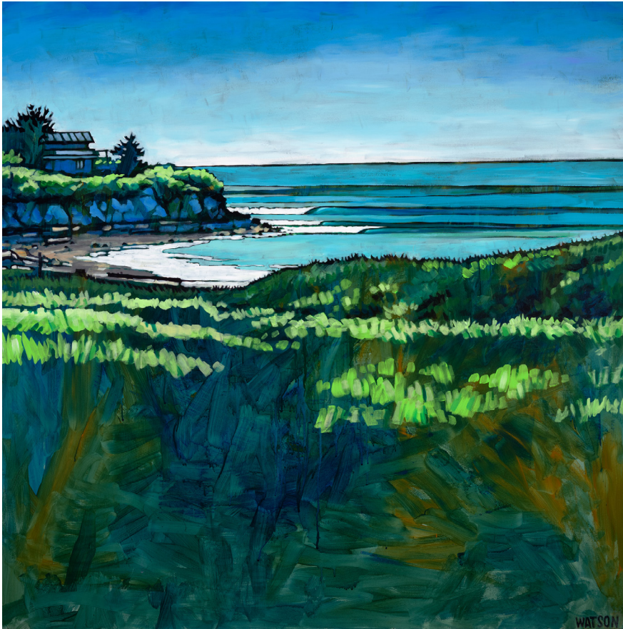
Left: We Are Here. 2026. 5x5'

Acrylic on wood panel. Fine art painting of North Beach. Local scene in my favorite style of painting.