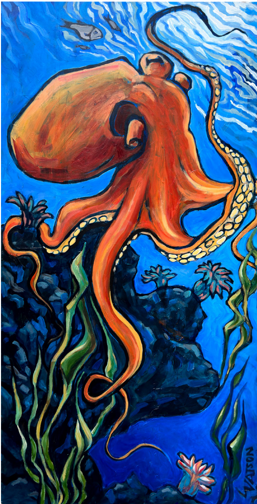
Left: Octopus' Garden