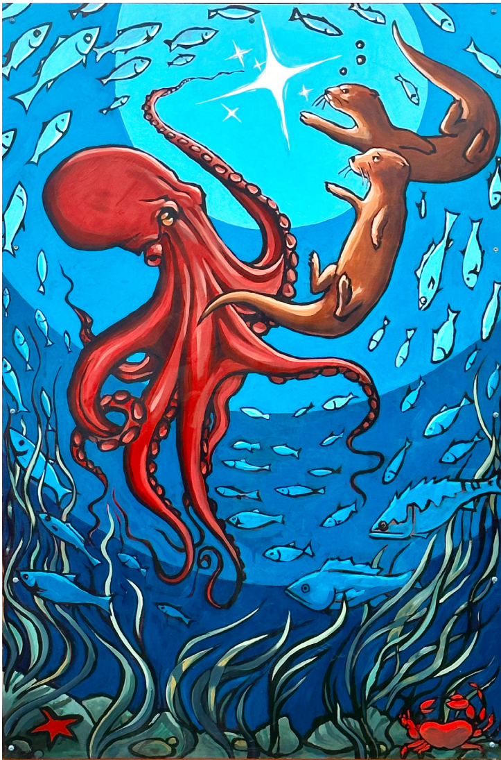
Left: OCEAN School Mural. 04/2023. 8x4'

Acrylic on Okume, Acrylic gel medium, Golden Mural Tech Acrylic paint and UV Varnish.