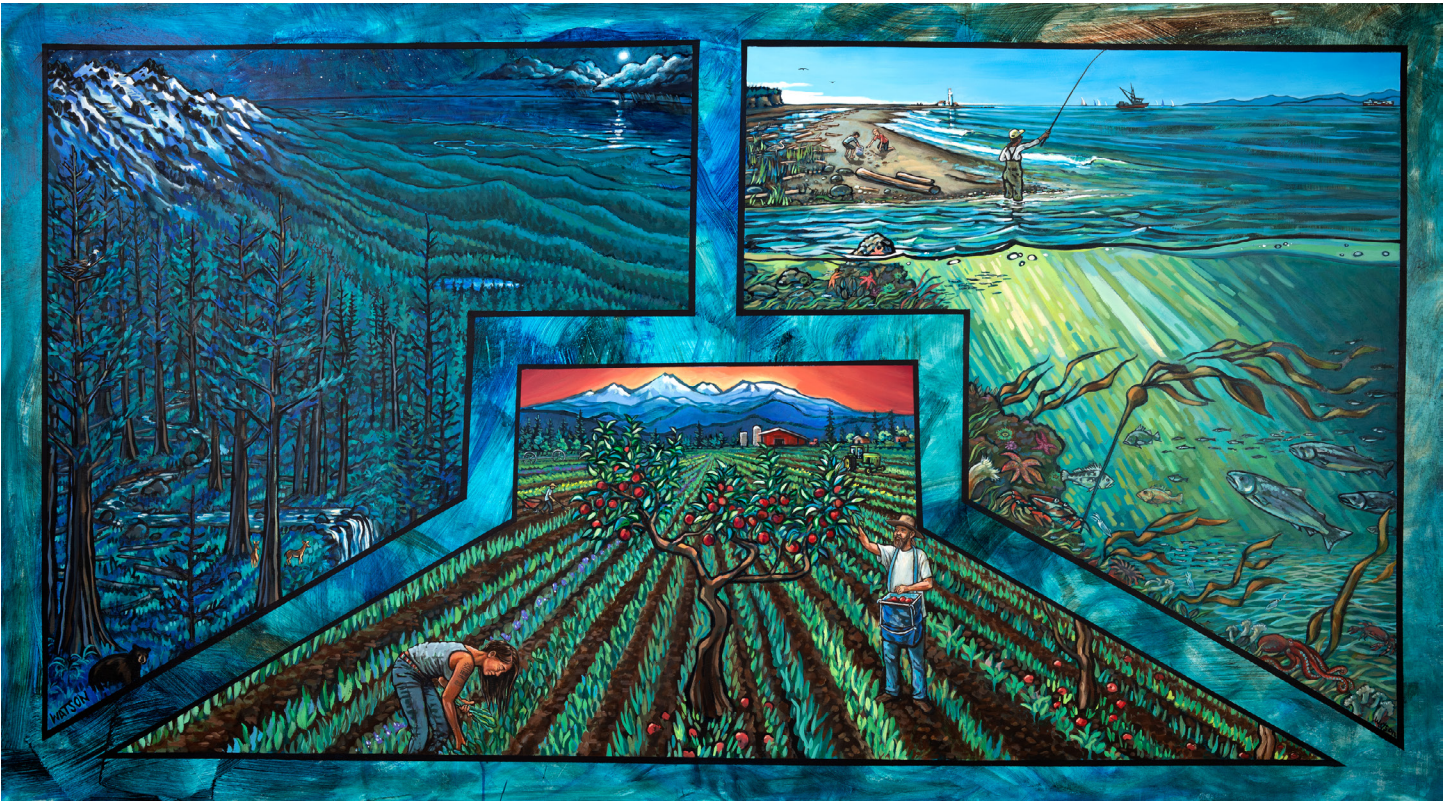
Above: Watershed Mural. 05/2021. 4x7' Acrylic on Okume, Acrylic gel medium, Golden Mural Tech Acrylic paint and UV Varnish.

Commissioned by the Finnriver Cidery and Farms. Chimacum, WA $8000 Working with a high school senior we gathered info from a vast number of industry leaders who's fields are dependant upon a healthy watershed. Using data from Fishing captains, WA Fish and Wildlife directors, City Water officials and many more, we created the concept of the mural to show the many facets of our watershed and its vital importance. The high school student helped develop the concept and paint the final mural.