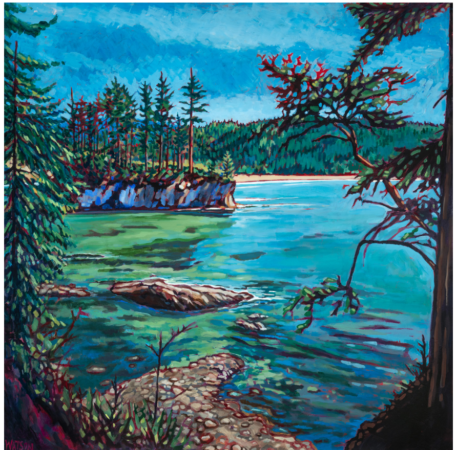
Right: Ashley's View - Salt Creek. 2026. 5x5' Acrylic on wood panel. Local Landscape of Salt Creek- Crescent Beach, where I often surf.

Acrylic on wood panel. Fine art painting of North Beach. Local scene in my favorite style of painting.